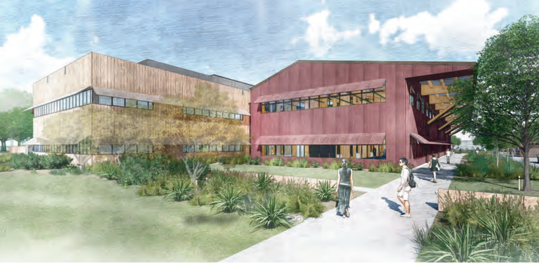
Our new facility in Lincoln is advancing well (top) with coloured precast panels in place and ComFlor being laid in the science wing. We are on track to occupy the building in 2024.